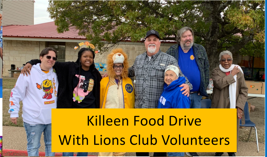
Killeen Food Drive With Lions Club Volunteers