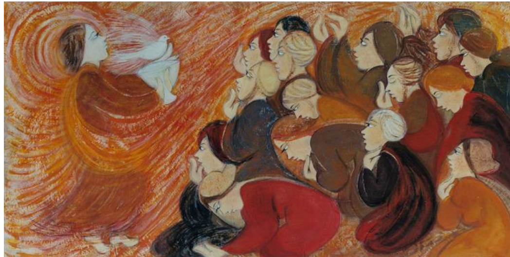
Nalini Jayasuriya (Sri Lankan, ?–2014), The Great Commission , 2002. Mixed media on canvas, 28 x 53 in.