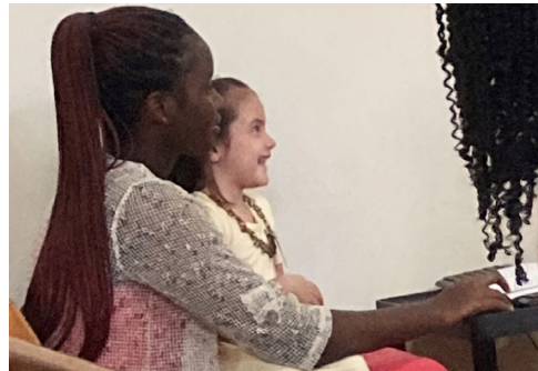
Media team and one in training!

This team supports worship by reading lessons and leading the Prayers of the People. Eucharistic Ministers assist the rector in administering Communion.