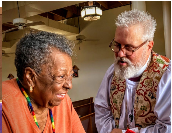
Bishop Doyle Visit