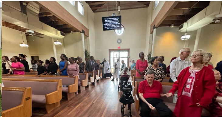
Sanctuary during Service