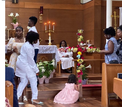
Youth Sunday School / Christmas Pageant / Flowering the Cross