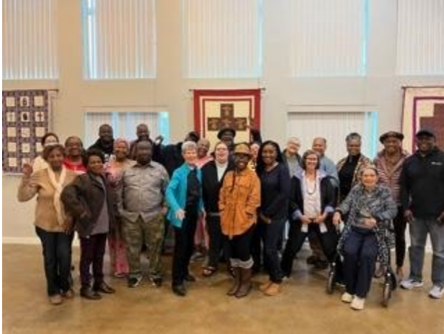
Retreat for the Vitalization Cohort