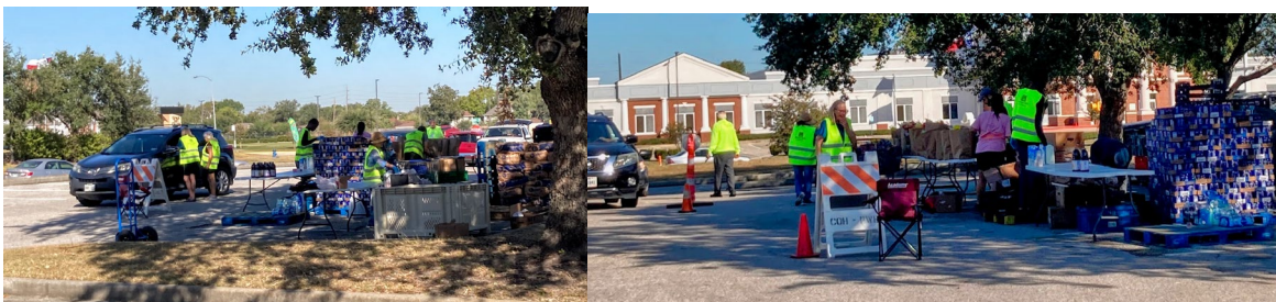
Food Pantry - Tuesday and Saturday

We house the Mission Bell Food Pantry that distributes food twice weekly to those in need. In collaboration with other diocesan churches, we also provide disaster relief and support to those in crisis.