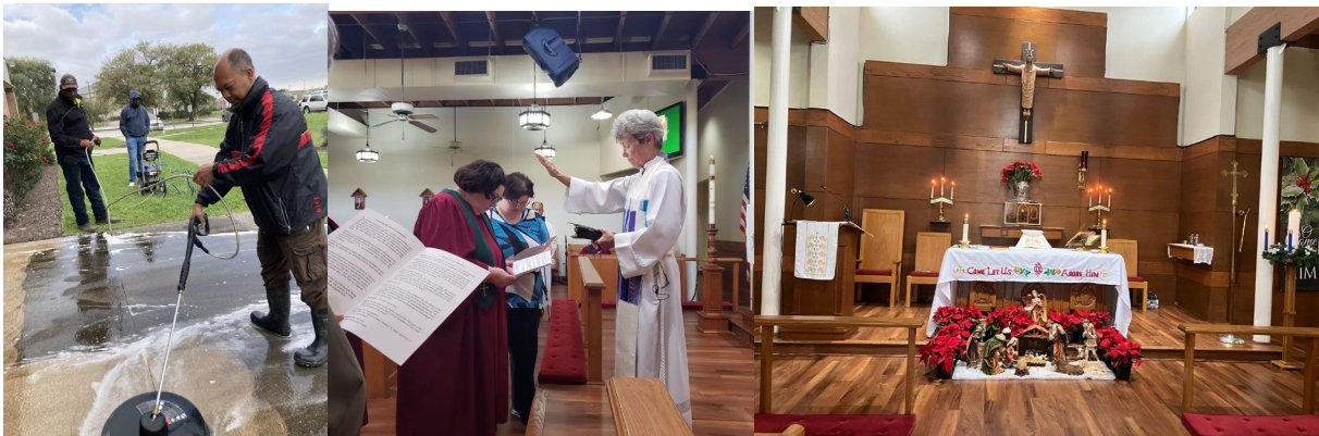
Men at work caring for grounds / Installation of DOK members / Altar at Christmas

We foster spiritual growth through groups such as the Order of the Daughters of the King, Brotherhood of St Andrew (inactive), Men's Group, Episcopal Church Women (ECW), and weekly Bible studies. Our activities also include an Annual Thanksgiving Bazaar, Special First Sunday of the Month Thanksgiving services, and an Annual Fundraising Dinner.