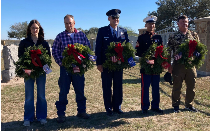
Wreaths Across America- Honoring our Military