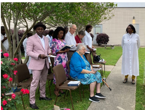
Sunrise Service in our Memory Garden

Christ the King offers a Sunday worship service at 10:30 a.m., featuring traditional Rite II with Eucharist and music. This service includes a sung liturgy, music by our talented organist, and a Children's Chapel program for religious instruction.